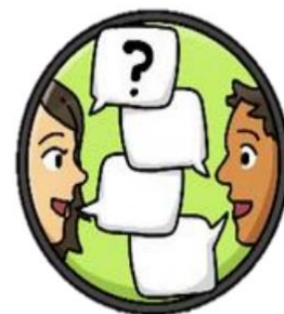
Inquiry through Dialogue